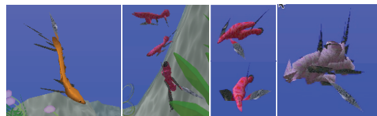
Fig.3 Vivid animated creatures.

Our prototype system "Darwin's Lake" explore infinite variation of 3d creature from user's sketch, but don't lack of the identification as a content at all. What users should do is drawing a 2d closed shape, and selecting a model parts, and then 3d creature is generated easily. The generated creatures can be animated as if it is alive in this system. Additionally our algorithm can animate more than 500 creatures in real time using low spec PC using CPU only.